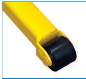
Outrigger Load Wheels